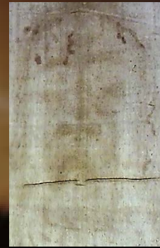
1 st Easter